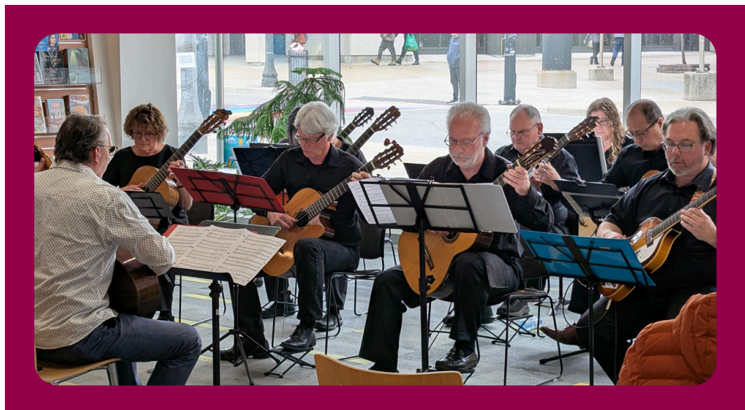
The Guitar Society of Brantford performs at Main Branch.